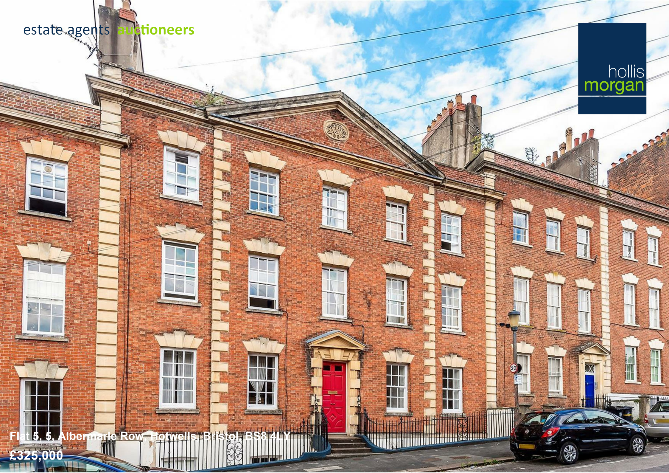
Flat 5, 5, Albermarle Row, Hotwells, Bristol, BS8 4LY